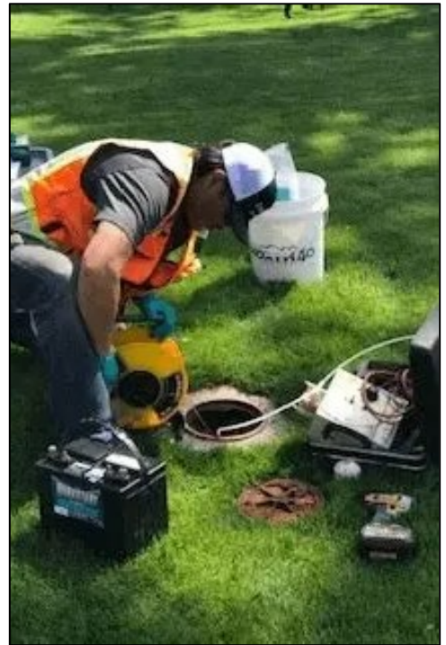
Figure 4. Sampling groundwater from a monitoring well.

Finalized environmental reports and work plans developed as part of the investigation are available on the U.S. Air Force Civil Engineer Center Administrative Record online at https://ar.cce.af.mil/ . Copies of the documents are also available at the Westfield Athenaeum Library. Quarterly Restoration Advisory Board (RAB) meetings are held in Westfield, and community members are welcome to attend. The RAB meetings typically occur the fourth Thursday of the month at 6 PM. Please confirm the latest schedule and location information on the RAB website at https://www.104fw.ang.af.mil/About/Restoration-Advisory-Board/ .