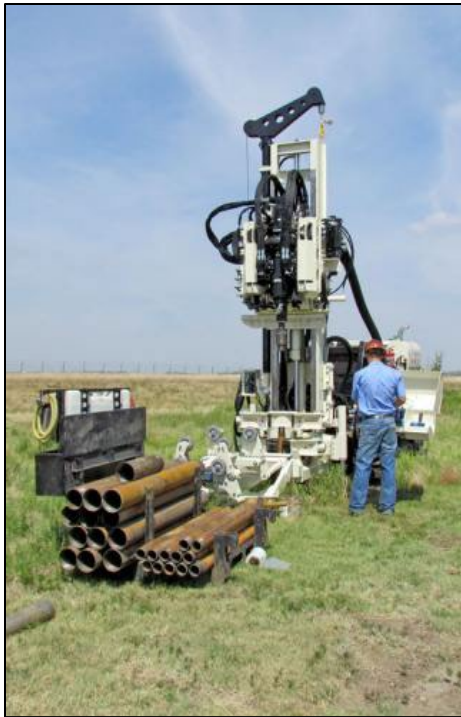
Figure 2. An environmental sampling drilling rig that can be used to sample soils and groundwater.