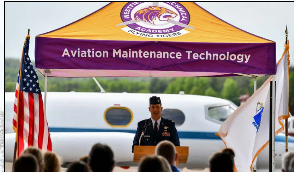
Leadership speaks at graduation