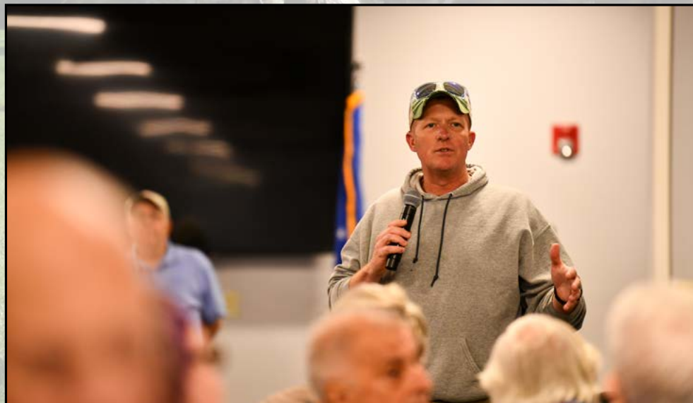
104FW Alumni Dinner