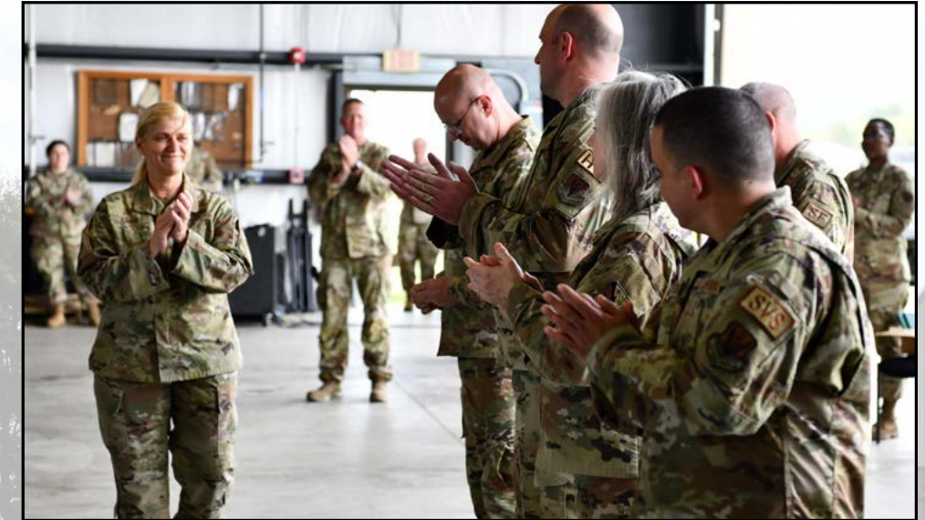
Task Force Powderhorn awards