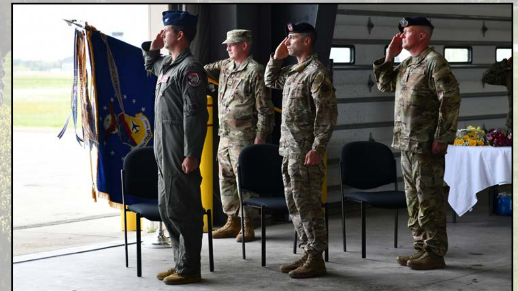
New command chief