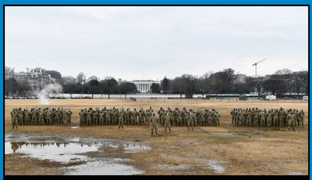
104FW supports Task Force Freedom

Welcomes, Farewells, Promotions, Recruiters, Wellness Center