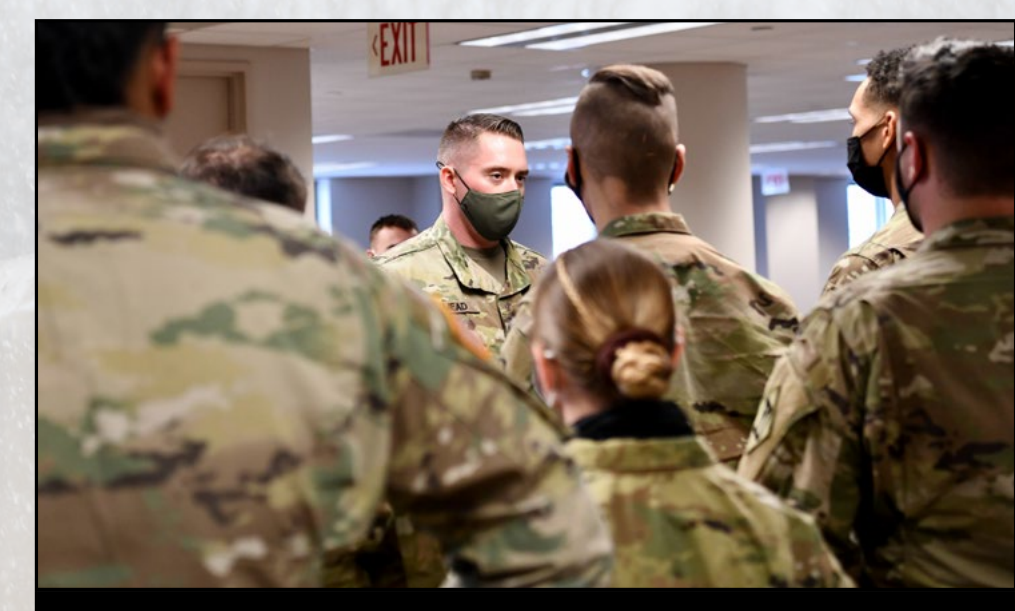
MAANG briefed on civil unrest response