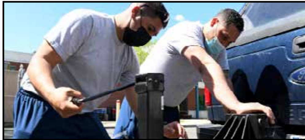
Fatality Search and Recovery Team Training