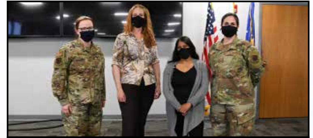
It is ok not to be ok