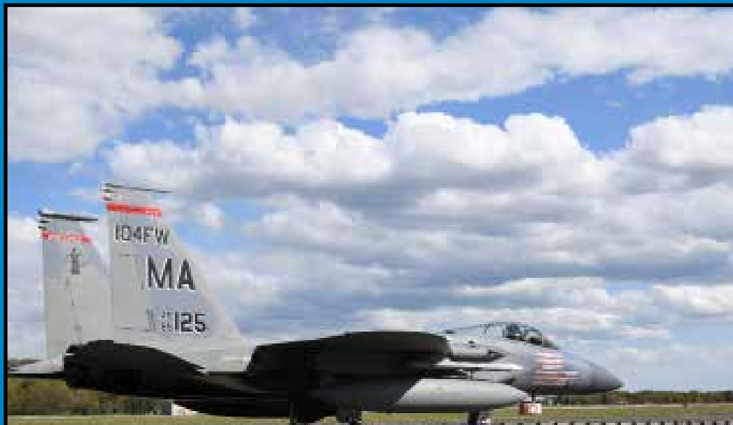
125 Hits 10,000 Hours