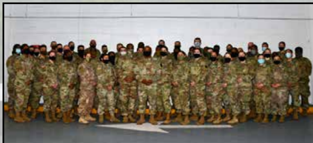
NGB SEA Whitehead Visits MA Troops in DC