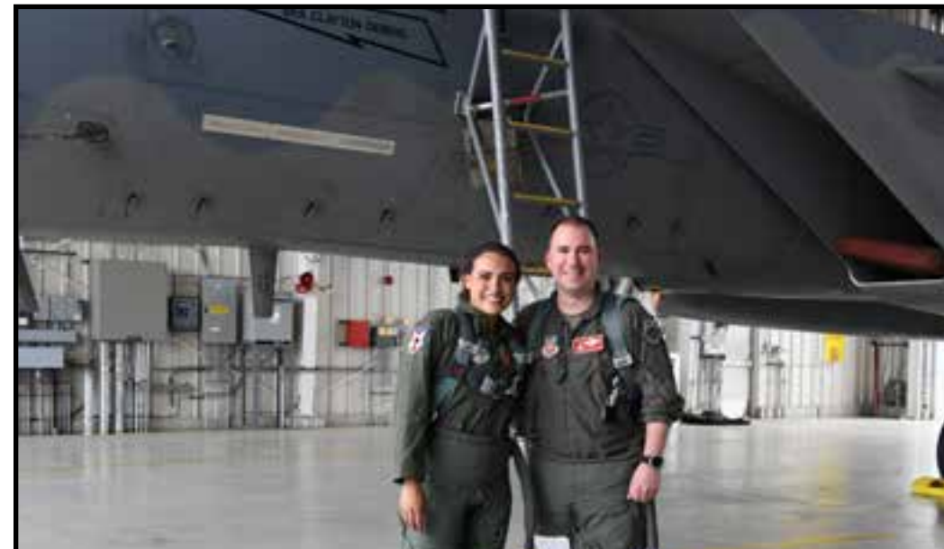
Fontenot Incentive Flight

View all Command Media, news, Air Scoops and more on the Air Force Connect Mobile App. Add the 104th Fighter Wing to your favorites. Available on the Apple App Store and Google Play Store