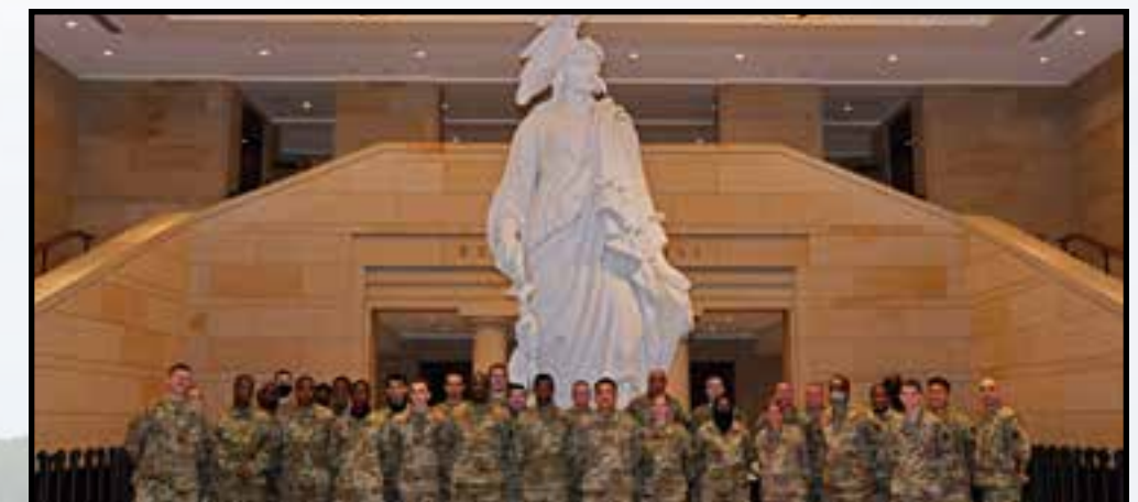
Combined Award, Promotion Ceremony