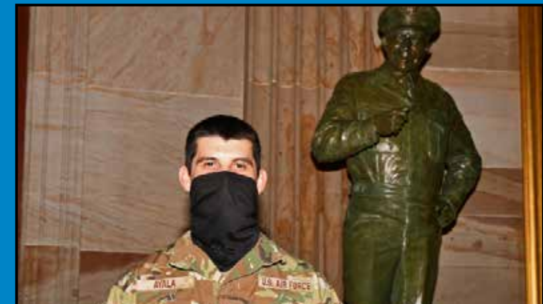
Avionics Airman on Mission in DC