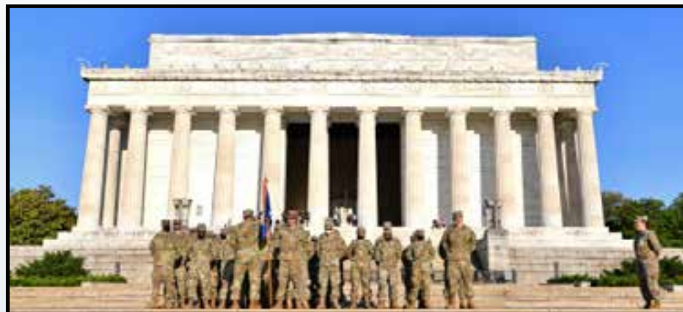
Reenlistment Ceremony at Lincoln Monument