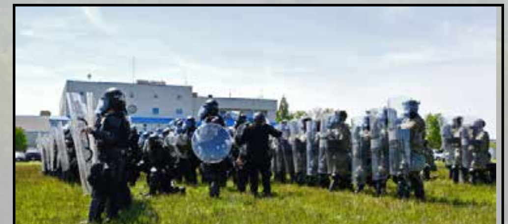
Civil Disturbance Training in DC