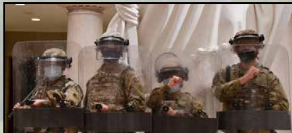
Mass Guard on Mission in DC