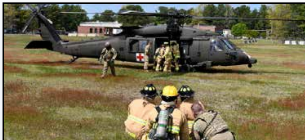
Incident Response Training