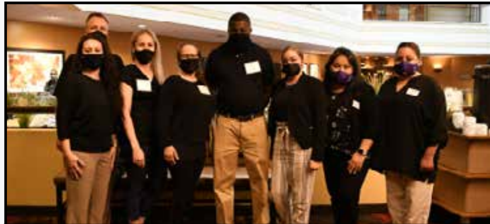
Yellow Ribbon Event