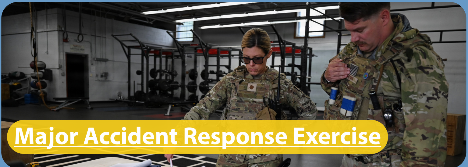
Major Accident Response Exercise