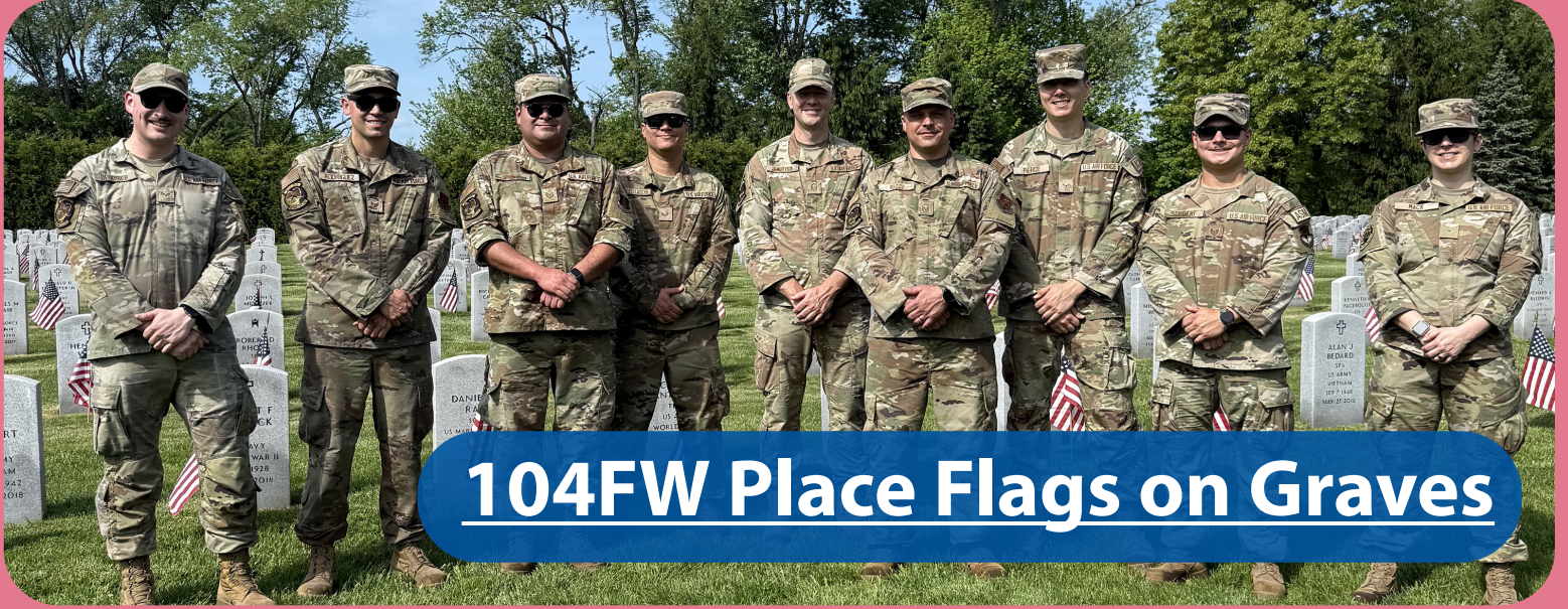
104FW Place Flags on Graves