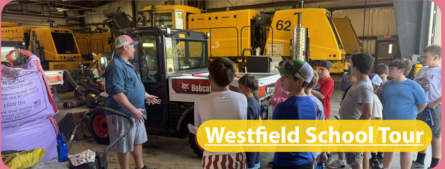
Westfield School Tour