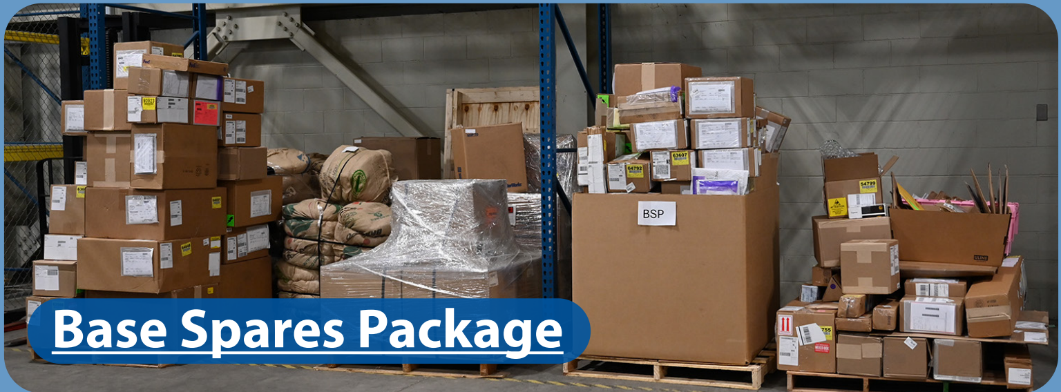
Base Spares Package