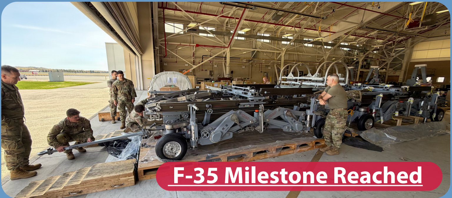
F-35 Milestone Reached